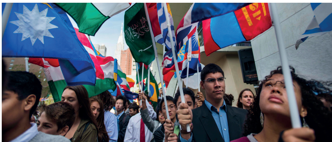
Students carrying Member States' flags during annual Peace Bell Ceremony, United Nations, New York, 2015

On November 8, 2007, the General Assembly of the United Nations approved Resolution 62/7, which states that democracy is a universal value based on the freely expressed will of people to determine their own political, economic, social and cultural systems 1 . That is why September 15th was declared as International Day of Democracy.