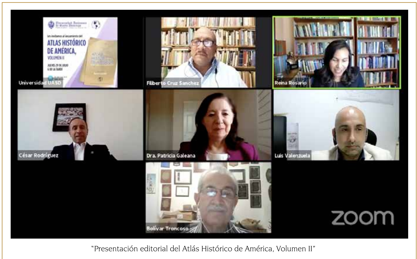
"Presentación editorial del Atlas Histórico de América, Volumen II "