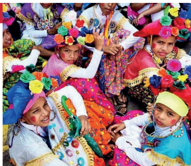
FOTO: HAROLD VARELA (2020), TEMA: CARNIVAL DE LOS NIÑOS (BARRAHOUILLA, COLOMBIA).