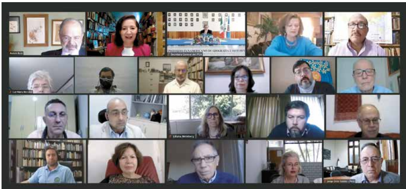
PAIGH authorities, representatives of the National Sections and members of the Pan American Network of Historians