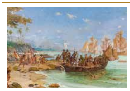
Bahia Independence Day: Brazilians defeat

the Portuguese and pro-imperialist, in San Salvador de Bahia.