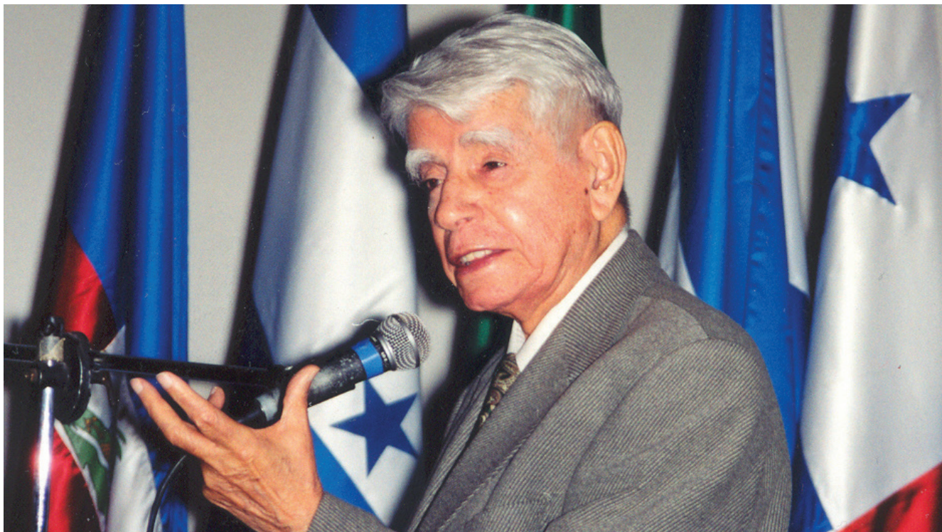
Doctor Leopoldo Zea

in America" from 1947 to 2004 at the Pan American Institute of Geography and History (PAIGH), and was author of more than fifty fundamental publications for the understanding of the Ameri-