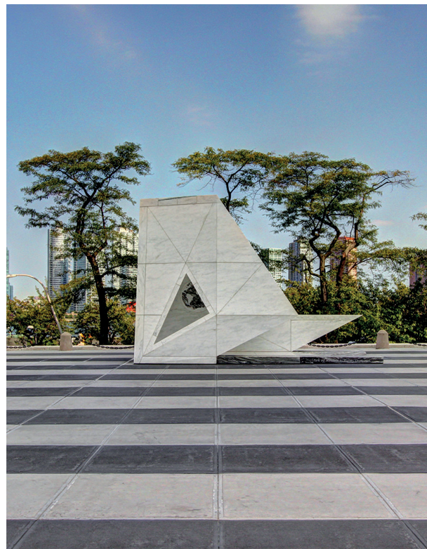
"The ark of return" by Rodney Leon, a permanent monument in memory of the victims of slavery and the transatlantic slave trade

From 1501 to 1830, for every European who crossed the Atlantic, four Africans arrived. The legacy of this migration can still be seen on the