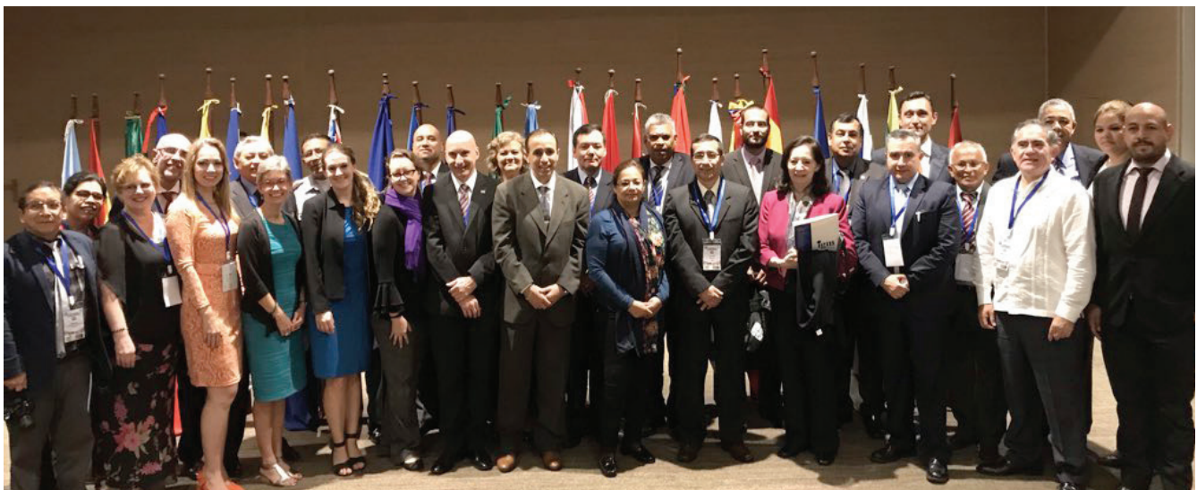
Attendees to the 48 th Meeting of the Directing Council of the PAIGH

From October 22 to 25, the 48 th Meeting of the Directing Council took place in the city of Santa Cruz, Bolivia.